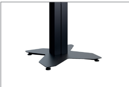
tilt proof baseplate with levelling feet